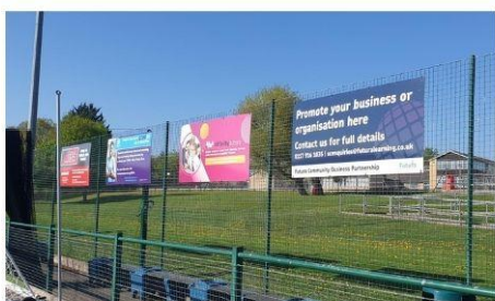
The first of our banners have now gone up at Wellsway Sports Centre